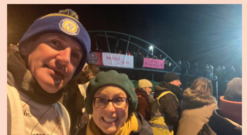
With TD Aodhán O'Riordáin at the East Wall for All rally

We've been working with local communities and asylum seekers to ensure decent conditions for all. We've also been calling for the six month wait before being able to take up employment to be halved. The wait is inhumane and unnecessary.