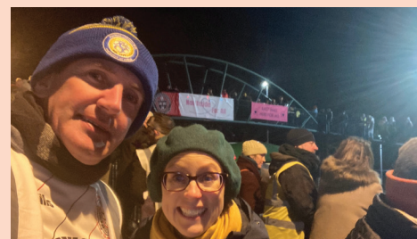
With TD Aodhán O'Riordáin at the East Wall for All rally

We've been working with local communities and asylum seekers to ensure decent conditions for all. We've also been calling for the six month wait before being able to take up employment to be halved. The wait is inhumane and unnecessary.